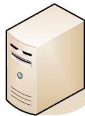
Online parts availability network