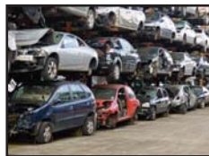
Whole vehicles and vehicle parts