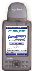
SoMo 650 with CF Scan Card and Buddy AI software