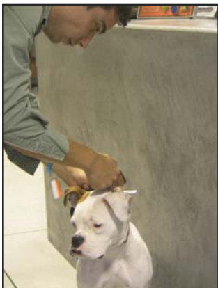
The Socket barcode scanner's wireless connection makes it easier to scan a dog collar tag.

Zoom Room currently uses 10 Socket barcode scanners at its 10 training centers and plans to purchase more for future locations.